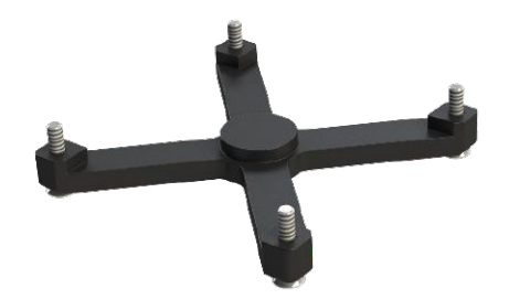
How to order